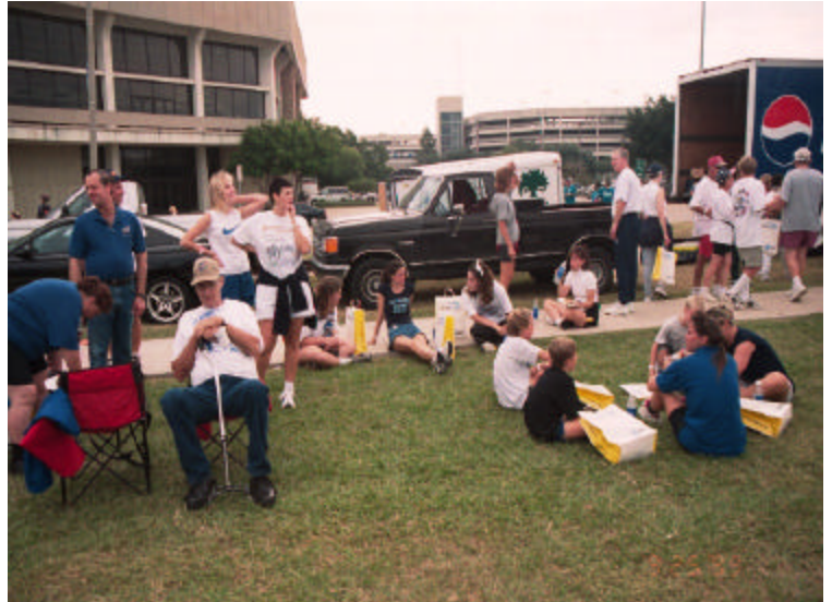
A well deserved rest after the ADA walk

At each home game we will be selling raffle tickets. If you would like to get in on the fun of selling