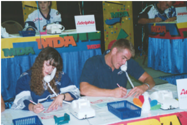
Working hard to raise money for MDA

tickets contact us for more info. The raffle is to help support various charities which this year will be Muscular Dystrophy Association, American Diabetes Association and Youth Hockey. The more we sell the more we can give to help people in need. Thanks for your support.