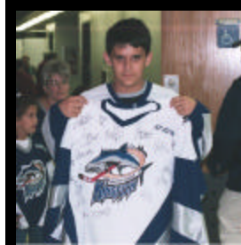
November winner of the Autographed Kingfish Jersey.